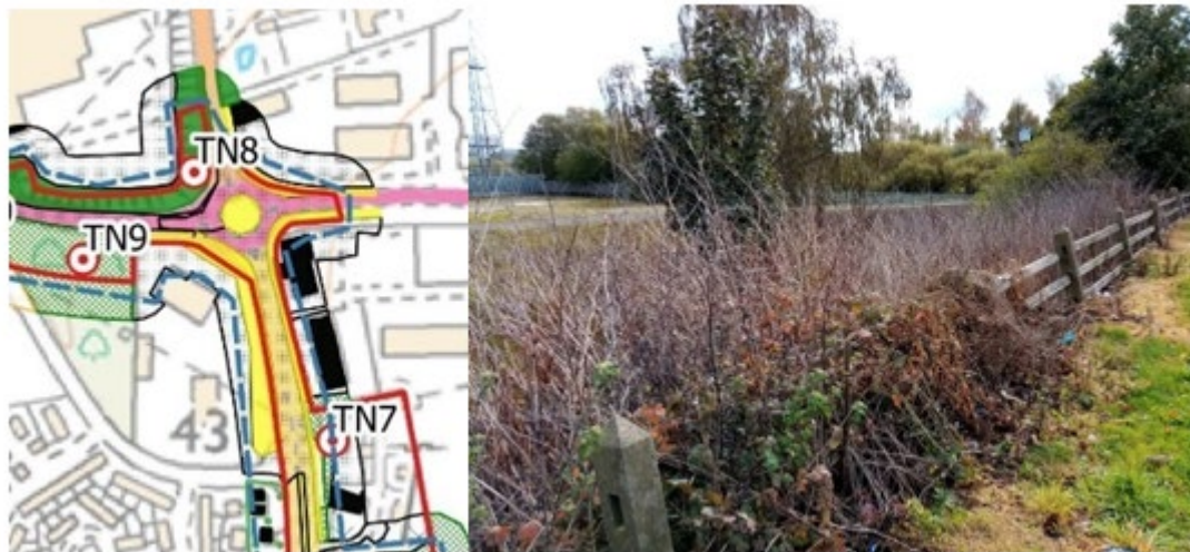
Figure I2: Location (TN7) and photograph of Japanese knotweed within Order Limits