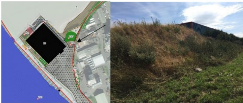
Figure I1: Location and photograph of Himalayan balsam within Order Limits